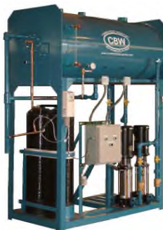
CBW Feedwater Tank

A compact feedwater system to take up less space by incorporating a water softener, feedwater pumps, control panel and hardness alarm into one system, ready to pipe into any system.